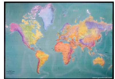
The Mercator map is common in U.S. classrooms, even though North America, Europe and Greenland appear much larger than they really are.