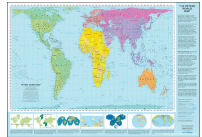
COURTESY OF ODT, INC. The Peters map is an 'equal area' map designed to show countries in accurate proportion to each other. Africa is 14 times the size of Greenland, and the map makes that clear.